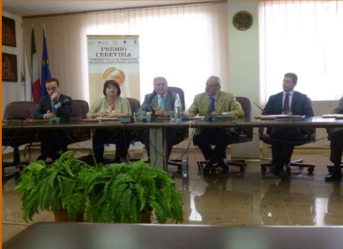
The Banab 2013 constitution Meeting